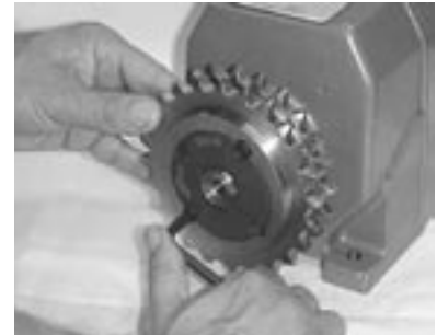
TIGHTEN SCREWS ALTERNATELY