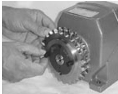
TIGHTEN SCREWS FINGER TIGHT