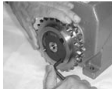
REMOVING A TAPER LOCK BUSH