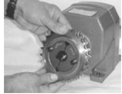
INSERT SCREWS AND LOCATE ON SHAFT